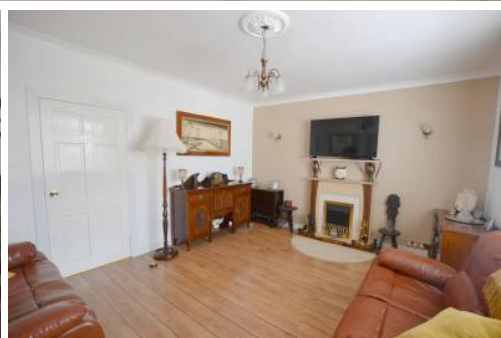
End of Terrace